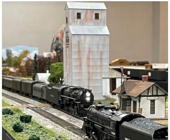
Steam power was dominant on the HO scale T-TRAK layout displayed at the MCR Regional Convention. The station and grain elevator are on one of Jerry Kruse's double modules.

Thank you to Sam Eisele for providing tables and all Division 1 members who volunteered with transport, set up and the running of trains. With each setup, the module members continue to complete scenery and refine set up and takedown.