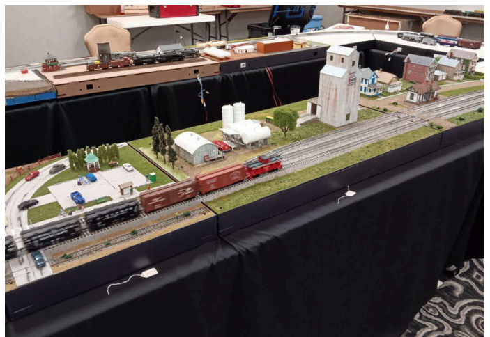
(above) Jerry Kruse's two doubles and a single module on display.